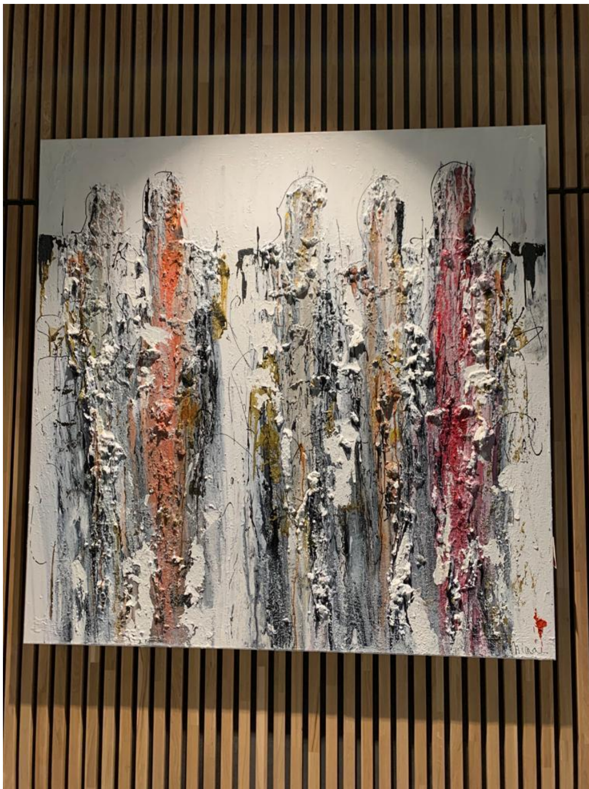
Collection Silent Figures, size 150 cm x H 150 cm, The day is an empty canvas, the shapes and colors are yours to choose. – Alex Noble