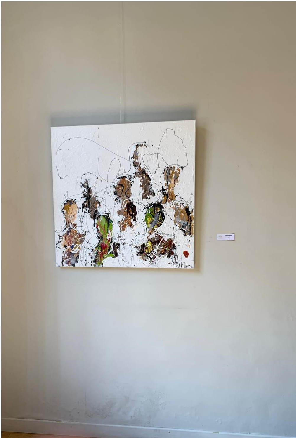
Collection Silent Figures, size 80 cm x H 80 cm, The Artist does not see things as they are, but as he is – Alfred Tonnelle