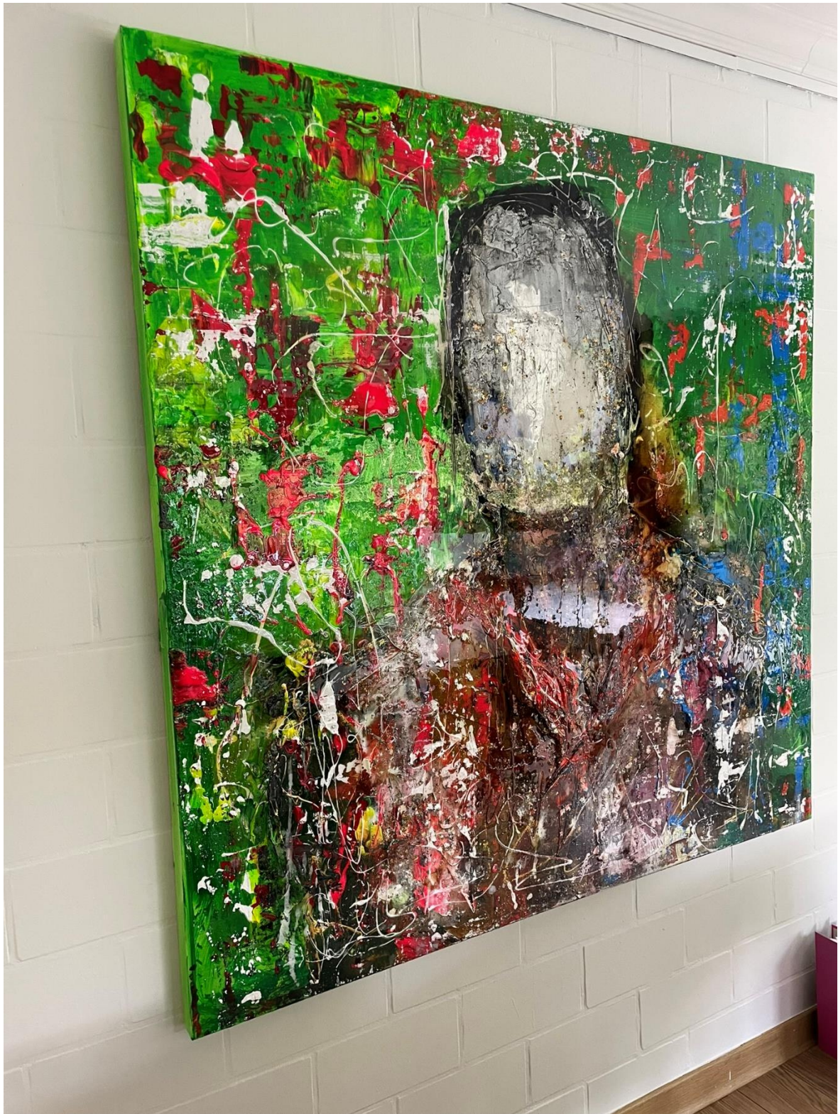
Collection Out of the box, size 150 cm x 150 cm, Creativity takes courage – Henri Matisse