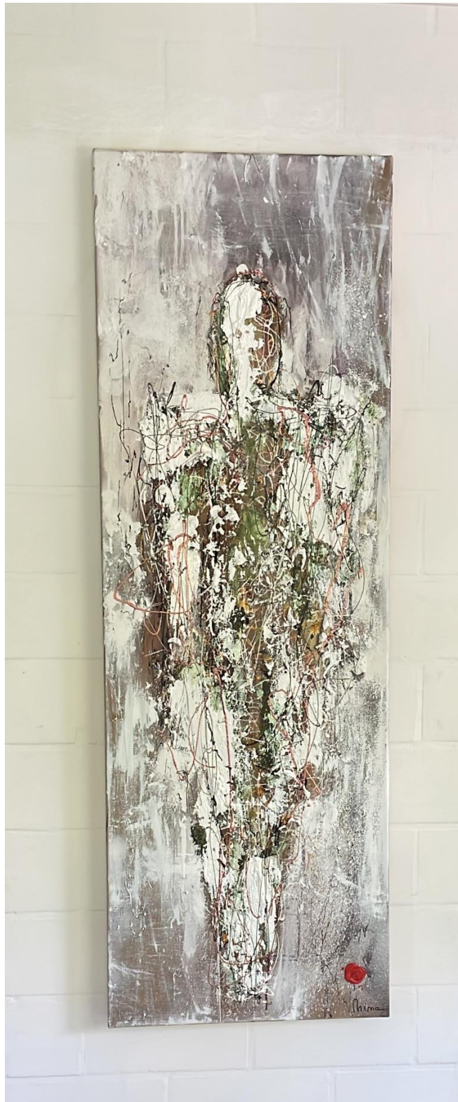
Collection Silent Figures, size 160 cm x H 40 cm, Where the spirit does not work with the hand there is no art – Leonard da Vinci