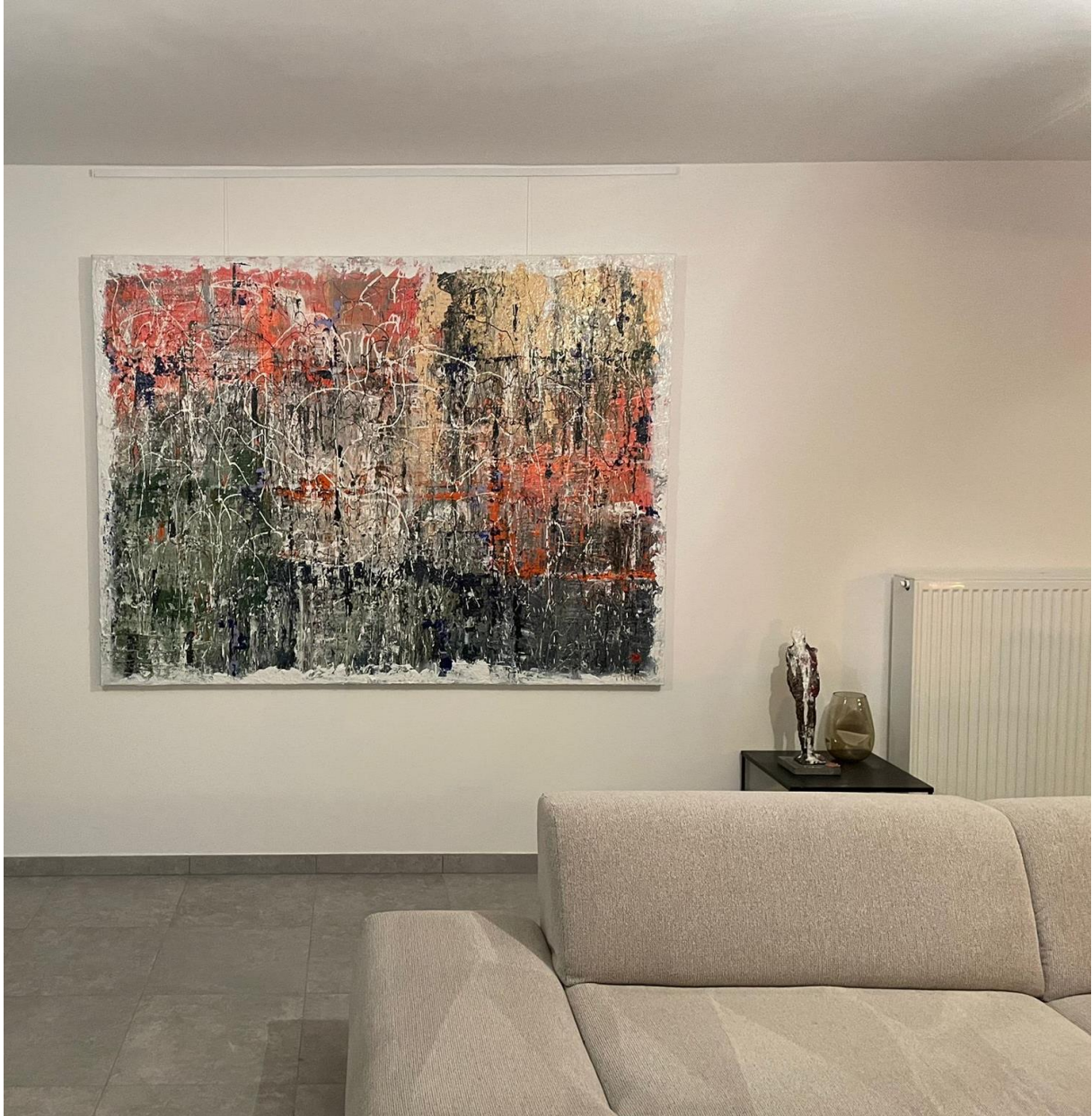
Collection Between Worlds , size 160 cm x H 120 cm, Art is not a thing; it is a way – Elbert Hubbard