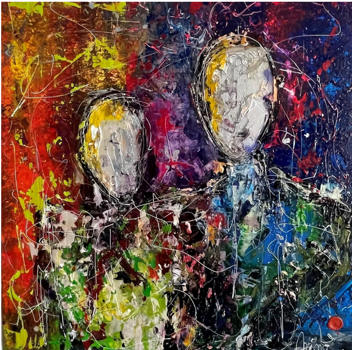
Collection Out of the box, size 90 cm x 90 cm, If I could say it in words there would be no reason to paint –