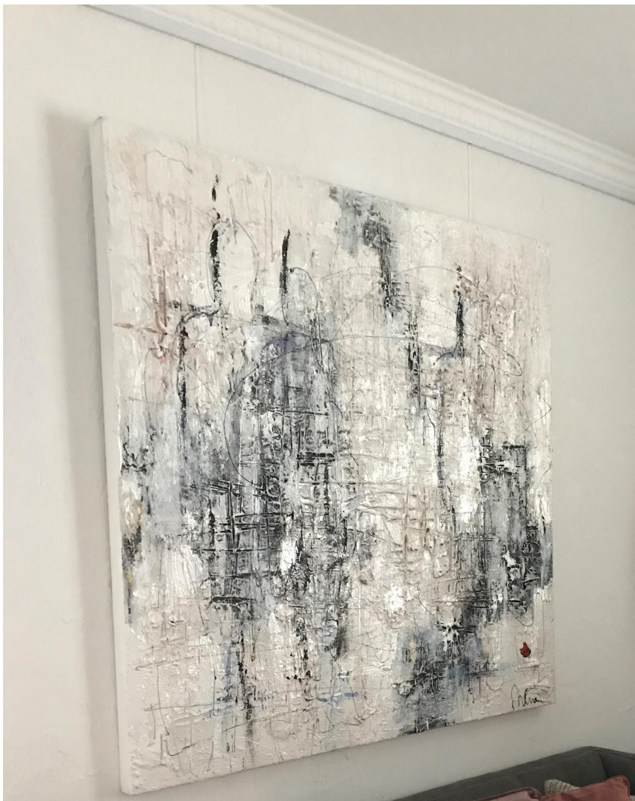
Collection Silent Figures, size 110 cm x H 110 cm, Painting is just another way of keeping a diary – Pablo Picasso